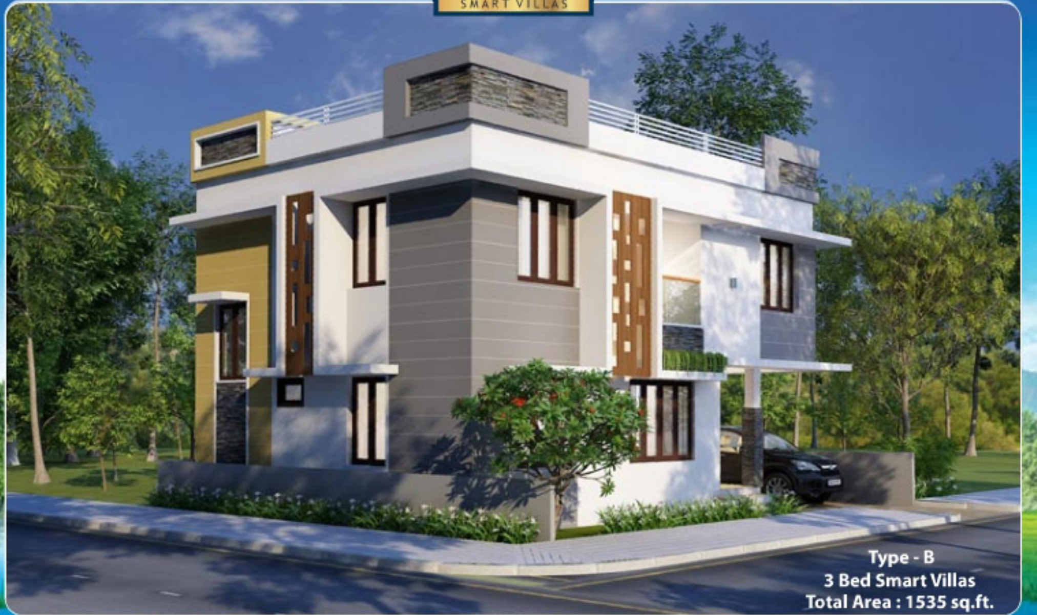
Type - B 3 Bed Smart Villas Total Area : 1535 sq.ft.