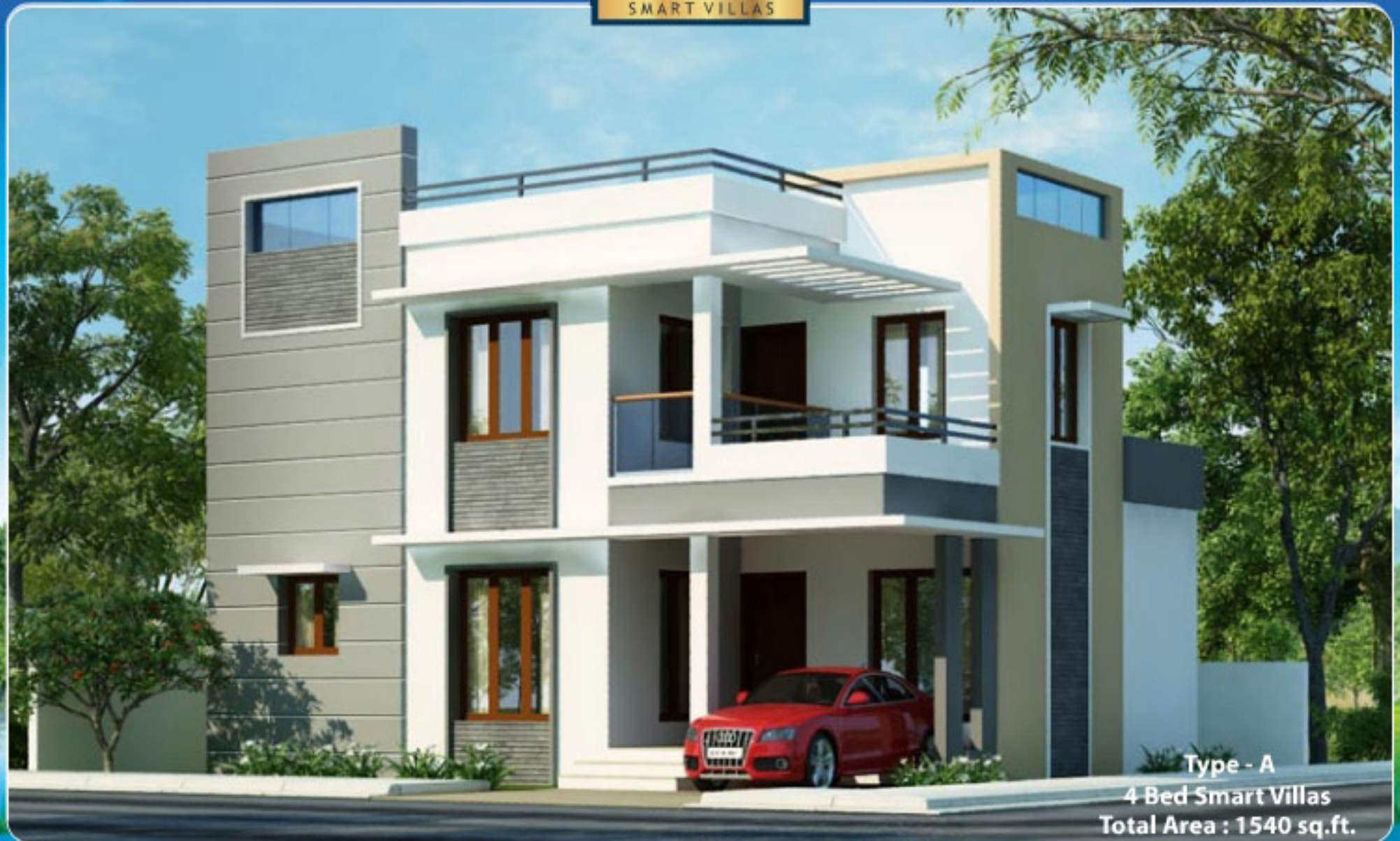
Type - A 4 Bed Smart Villas Total Area : 1540 sq.ft.